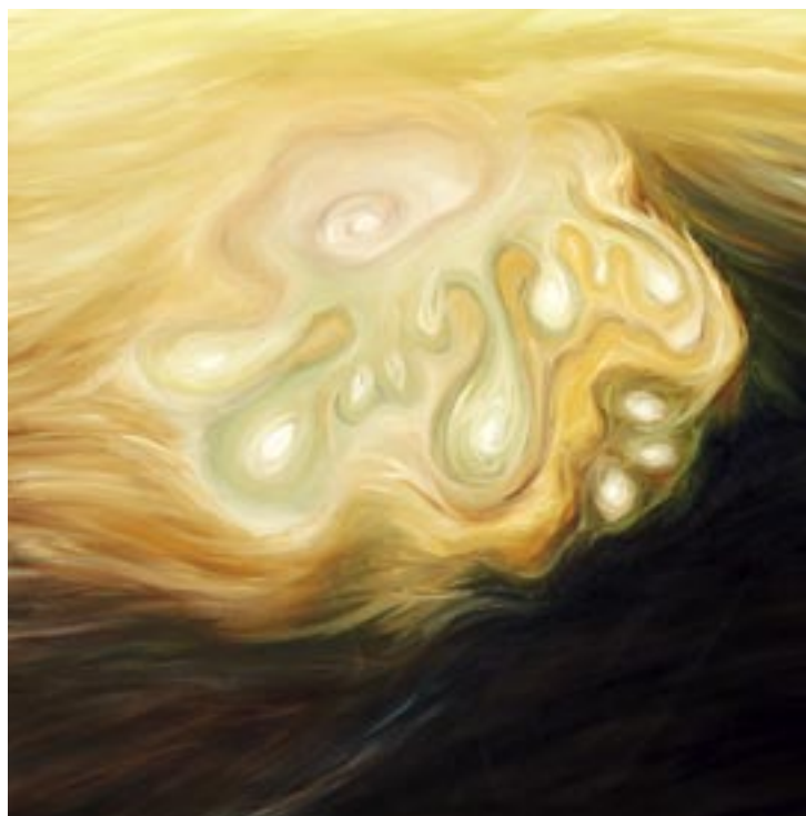
Lynda Howitt Lost in Love , 122x122cm oil on canvas